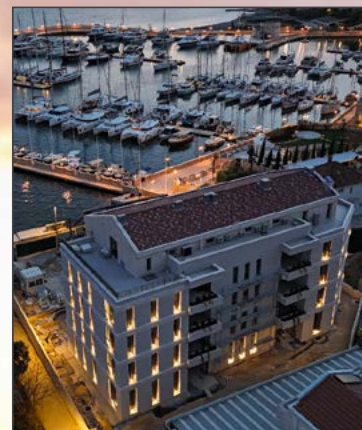
A Star Marina Luxury housing project of 32 flats Herceg Novi - Meljine Completed

As a property owner in Montenegro, you can apply for a residence permit and, if desired, earn Euro rental income by renting seasonally or long-term.