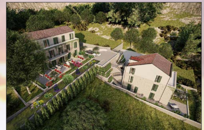
A Star Bay Housing complex consisting of 2 separate blocks Kotor - Prcanj Construction continues